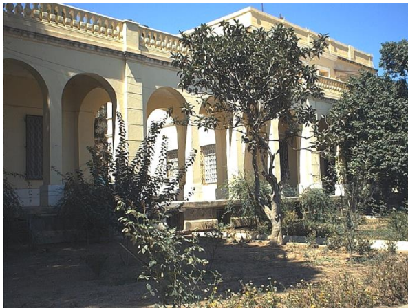
b Astr Office