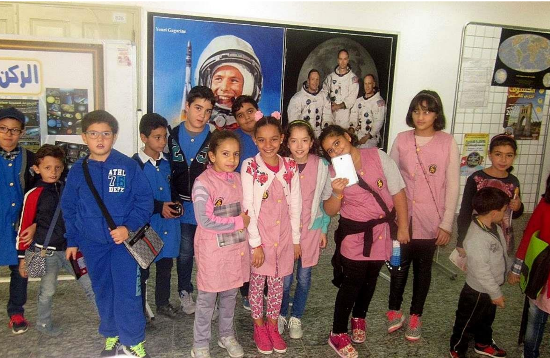
Once December 2019