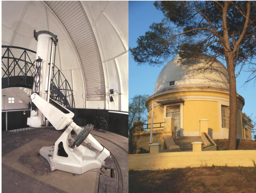
Télescope de Foucault (1888) September 1861 The Telescope was fabricated by Secrétan: Newtonian, \varnothing=50 cm, f= 3m50