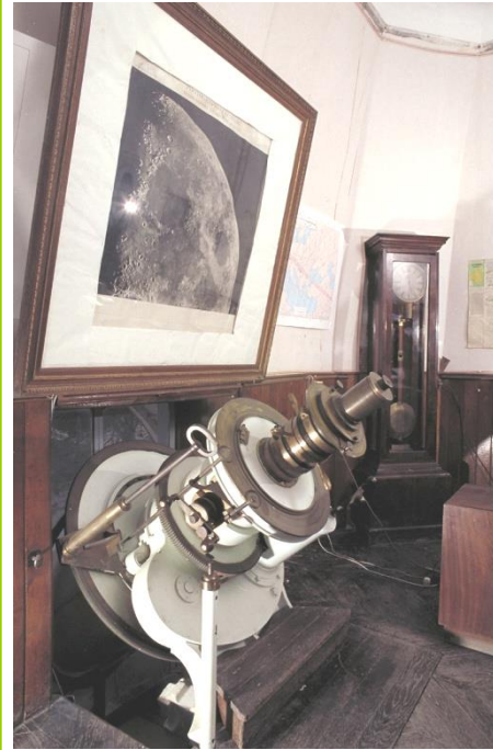
L'Equatorial Coudé (1888) Gautier ( \varnothing= 32 cm et f=6m60 )